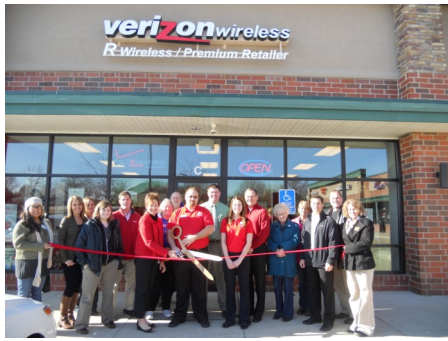
Above: Ribbon Cutting for R-Wireless on December 2nd.