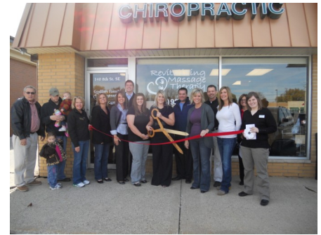
Above: Ribbon Cutting for Revitalizing Massage Therapy on November 4th.